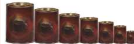
Vayhan Classic & Premium